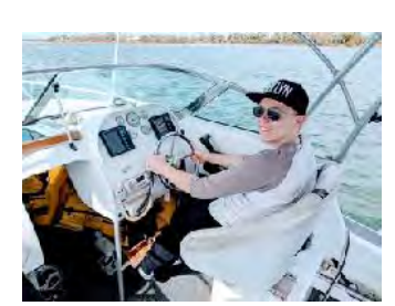
Lookout Lion Des I think Tysons after your job as Captain