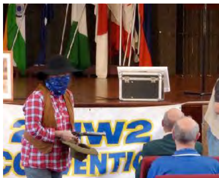
Bushrangers extracting funds from the conventionneers