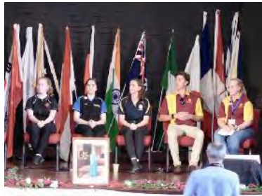
Lions Youth, Lions Future

The Mandurah Lions that travelled to the District 201W2 "Bushrangers" Convention hosted this year by the Lions Club of Armadale/Kelmscott had, by all accounts, an enjoyable time, hope you didn't lose too much money to the Bushrangers. If this convention, was your first one or one of many that you have attended, you find this time spent, is always informative and fun.