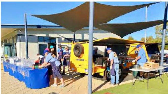
Left - LIONS AND FRIENDS hard at work on a busy day cooking for participants in the Relay For Life