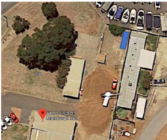
Above Proposed location of Sea Container highlighted blue

An application for Development Approval has been lodged with the City of Mandurah. Included in the submission is a request for the exemption of fee