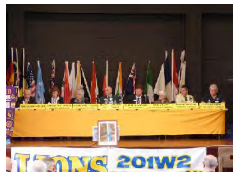
201W2 District Cabinet