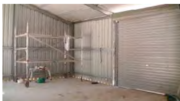
Above: The completed shed complete with whirlybird only a couple of doors to fit