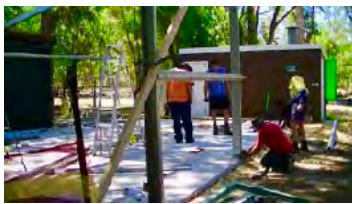
Above: The frame is being sorted, bolted together and then erected.