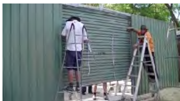
Left The walls are finished, now the roof sheets and roller door are to be fitted