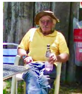
Above: Some of the hard workers enjoying a break