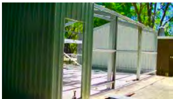
Left: Frames are finished and the outside sheets are now being fitted.