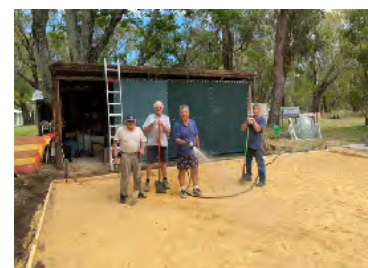
Right: Prepping the pad, months ago