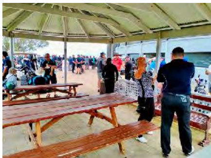
Below: Golfers waiting in their beautiful facility at the Mandurah country Club