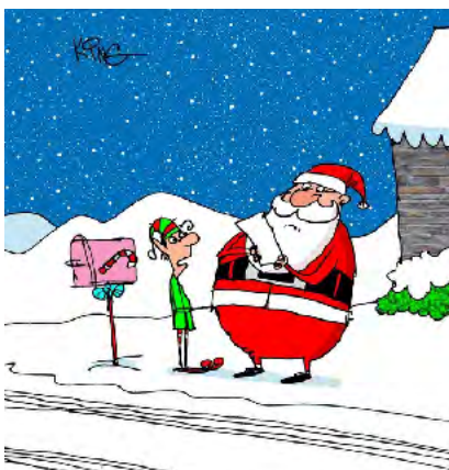
"That's the only letter you received in the mail. Kids no longer write letters. They email or text."

And with that a look of peace crossed the old man's face, and he took his last breath and passed away. As the others started to file out of the room the old man's wife whispered under her breath "Thank God he didn't ask me about the other five!"