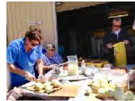
Then its all GO slicing onions and buns