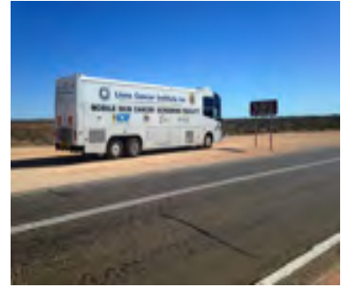
LIONS CANCER INSTITUTE The Mobile Skin Screening Bus on one of its trips North

At the commencement of my term as Third Vice President I was given thirteen areas of responsibility. In some areas we enjoyed success and others were not so successful.